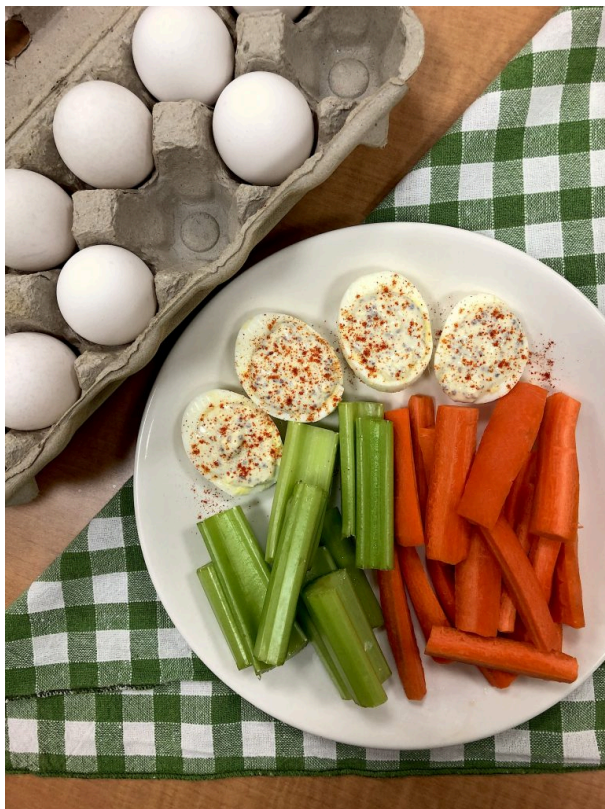
Deviled eggs served with carrot and celery sticks.

Number of portions: 1 Prep time: 5 minutes Total time: 5 minutes