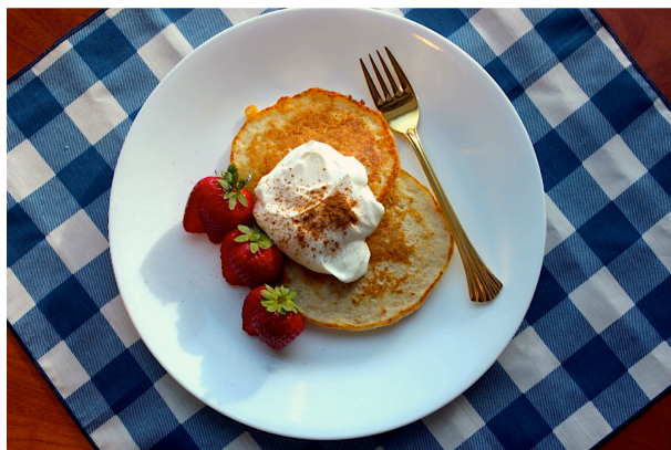
Pancakes served with Greek yogurt and strawberries.

Number of portions: 1 Prep time: 5 minutes Total time: 10 minutes