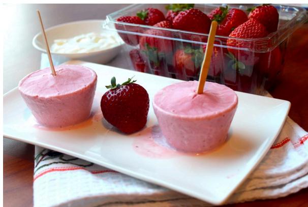
Strawberry popsicles served with fresh strawberries.

Number of portions: 2 Prep time: 5 minutes Total time: 6 hours