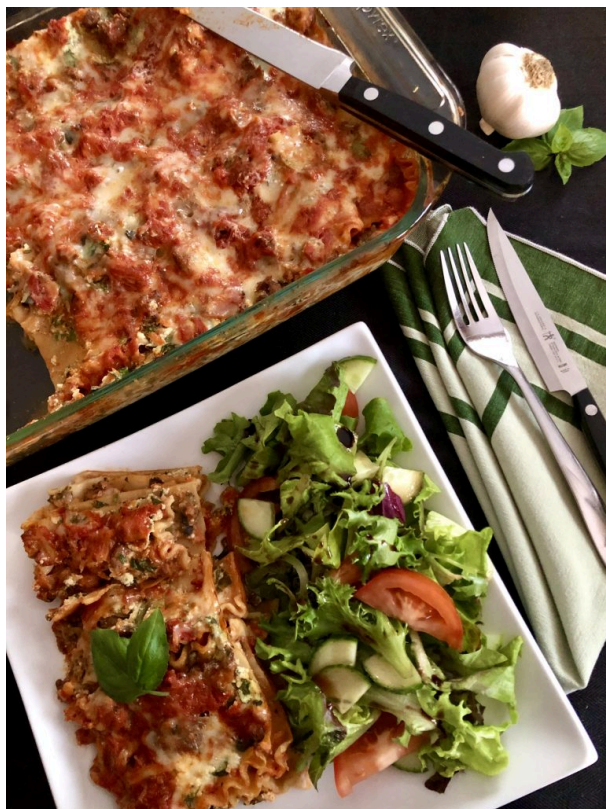
Lasagna served with salad greens.

Number of portions: 10 Prep time: 1 hour