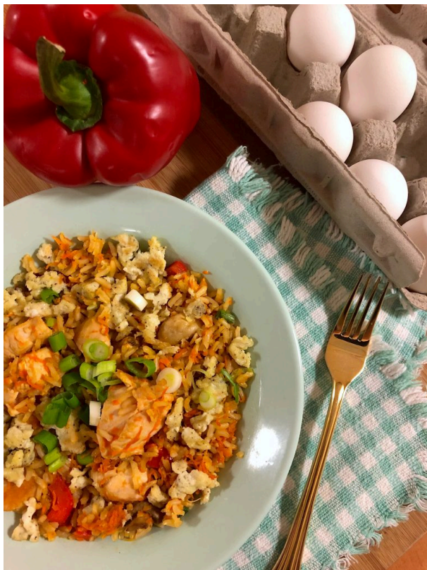
Fried rice with chicken, eggs, and vegetables.

Number of portions: 1 Prep time: 5 minutes Total time: 20 minutes